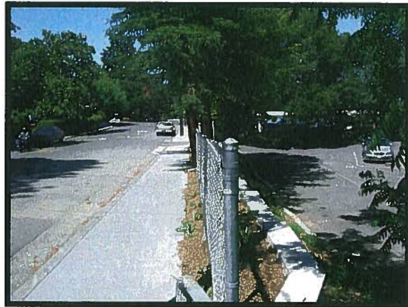
Huntley Street Sidewalk