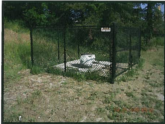
Laguna Force Main Replacement