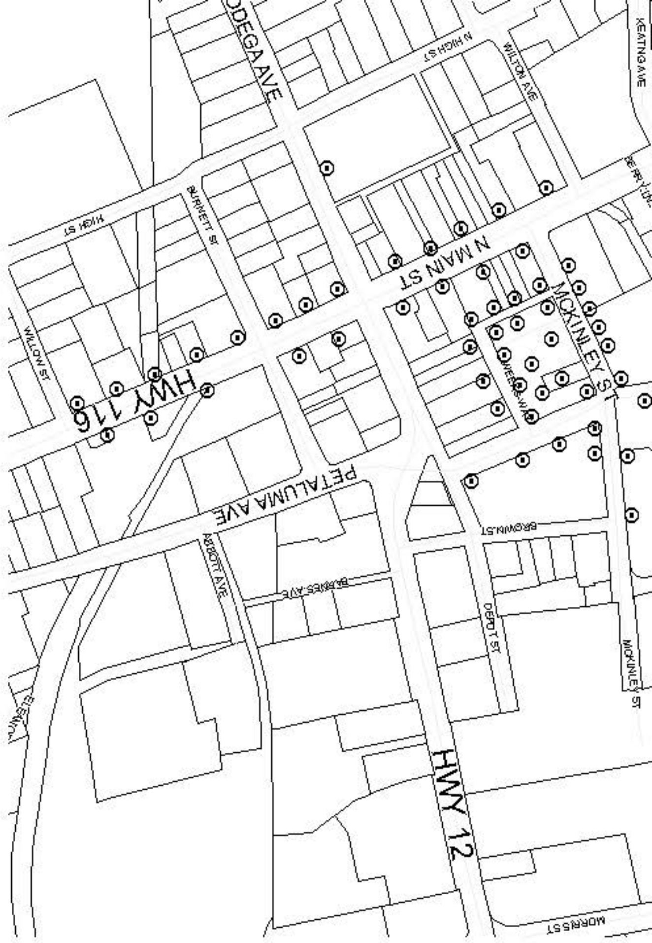
⊙ Approximate Location of Poles with Banner Arms